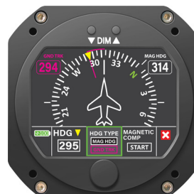
NEW MENU DISPLAY